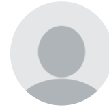
Strategic Planner, Melbourne Area

"I don't understand why this ramp survives in the current form - there have been chances to improve that were let pass. It needs doing and I'm past politely waiting."